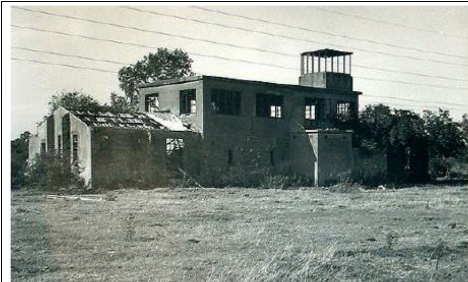
Former Airfield Control Tower.