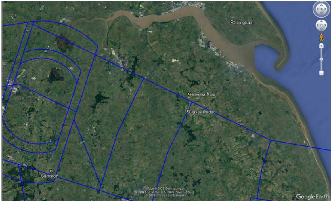
Figure 1: Proposed development location shown on an airways chart