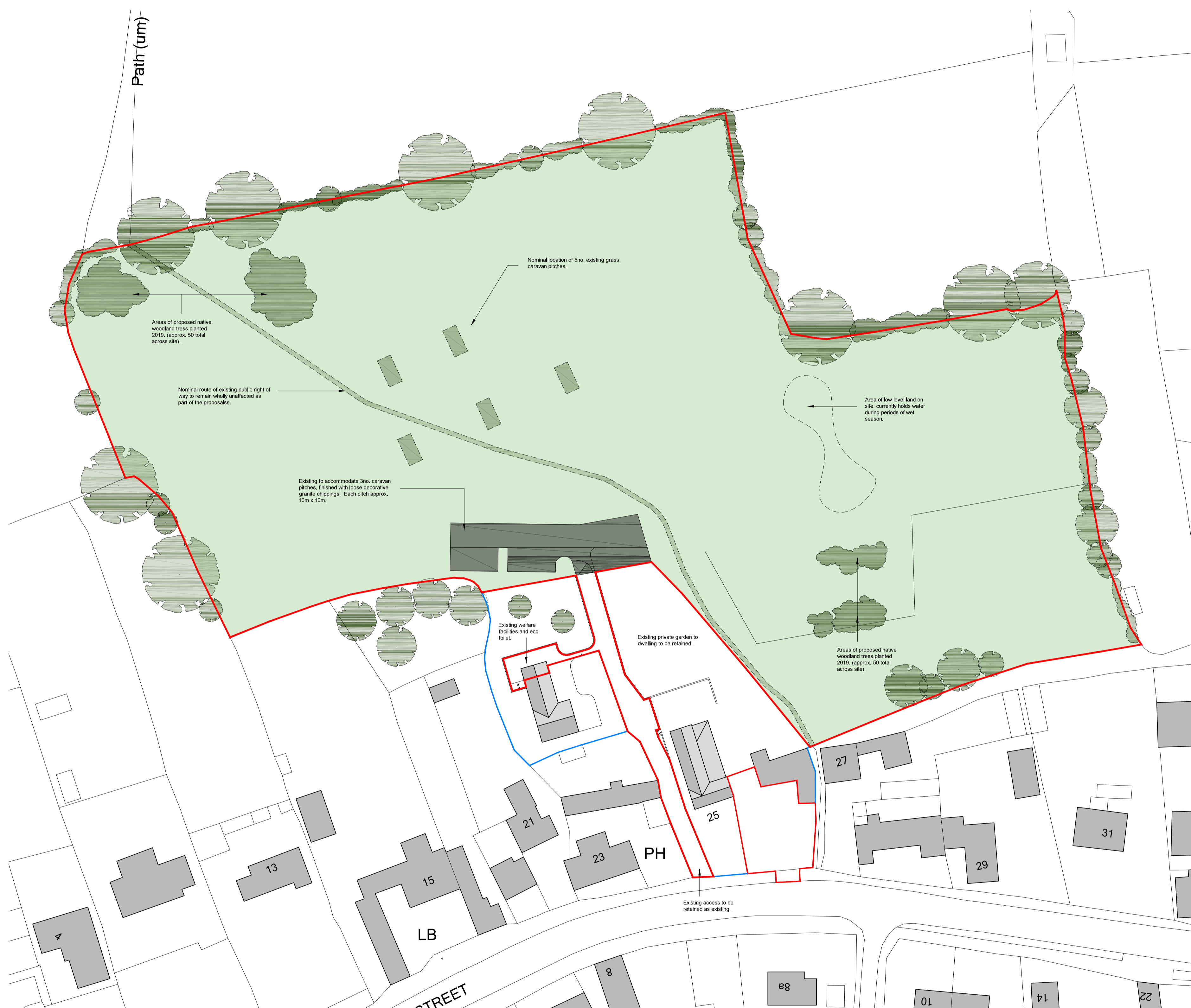
Site Plan as Existing (1:500)