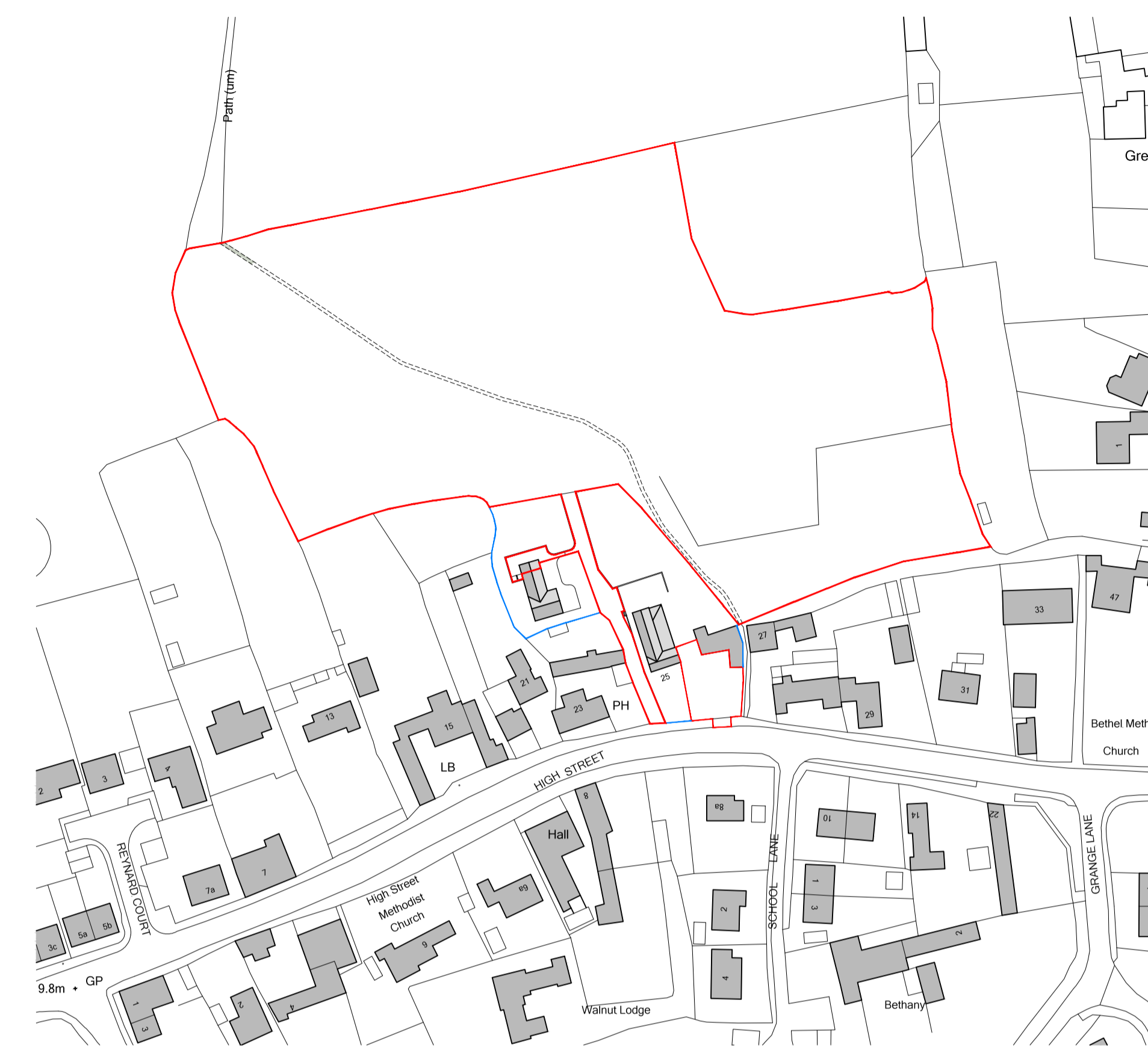
Site Location Plan (1:1250)