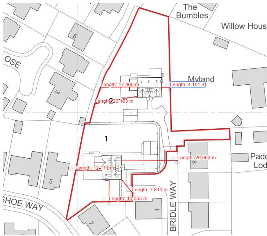
Fig 1- Separation distances.

In relation to overlooking, the rear elevation of Plot 1 would have 2no. rooflights in its rear (east) roof slope, one of which serves a bedroom and the other serving a bathroom. Whilst some views toward no. 5 Horseshoe Way would occur, it is not considered to be at a detriment to the amenity of these neighbouring occupiers. Other openings in plot 1, to the north, east and south elevations are also considered to be sufficient distances away from neighbouring dwellings as to not cause unacceptable levels of overlooking. Minor levels of overlooking are also not unusual within residential areas.